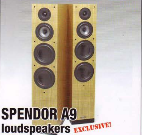
SPENDOR A9 loudspeakers EXCLUSIVE!