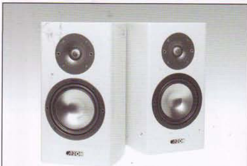
CANTON REFERENCE 9.2 DC loudspeakers EXCLUSIVE!

FREE READER CLASSIFIED ADS IN THIS ISSUE!