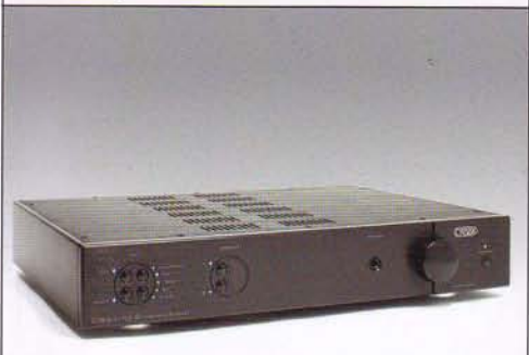
CREEK DESTINY 2 amplifier EXCLUSIVE!